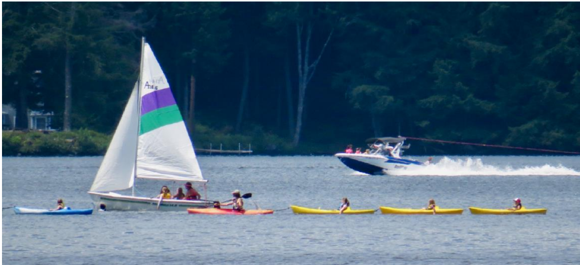
Figure 4. Vermont’s green, environmental-friendly, robust tourist economy depends heavily on its clean, clear, safe lakes and ponds. Here kayakers, sailors, and a water skier safely share the lake