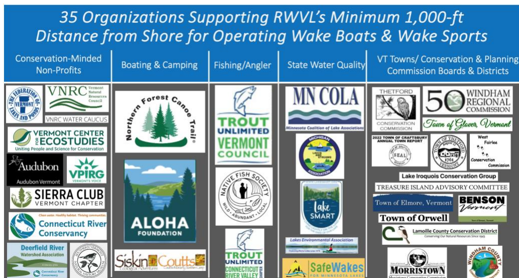
Figure 5. Public & private organizations supporting RWVL’s 1,000-foot minimum operating distance