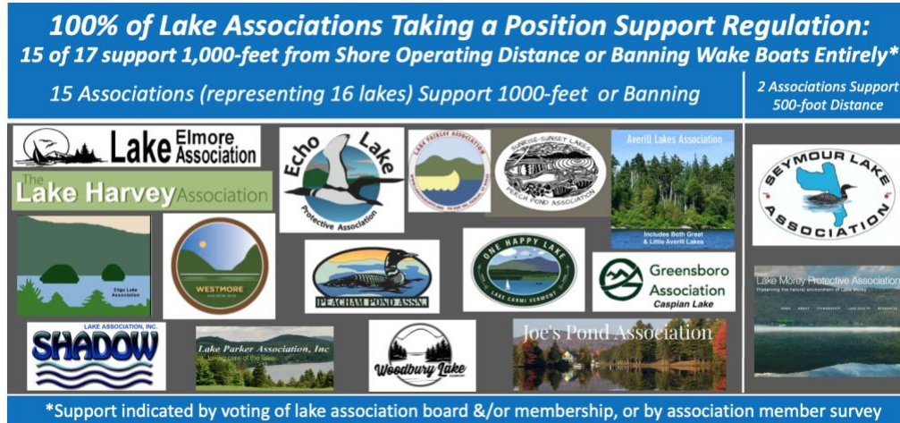
Figure 6. VT lake associations supporting wake boat regulation