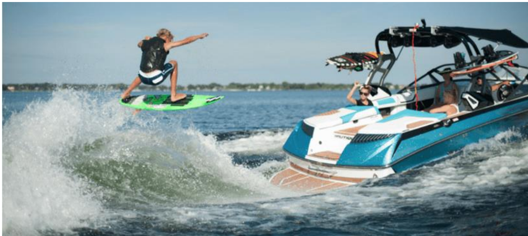
Figure 1. Appropriate wake surfing is being enjoyed >1,000 feet from shore, in water >20 feet deep, >200 feet away from other lake users, and with spotters and a wake boat driver

Public comments during the 16-month petition period have strengthened support for RWVL petition.